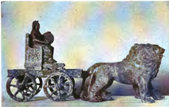
Fig. 42. Cybele in her Car.

THE skies that rule over all, and the great seas, are male beings; Zeus and Poseidon rule there. The earth, that gives life to plants and animals and men, that cares for and generously nourishes her children, is the great mother goddess, Gæa.